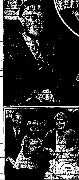
These are the famous Roosevelts who became the nation's first family today. They are four generations of the Roosevelt name. From left to right: Franklin D. Roosevelt, president-elect and Mrs. Roosevelt, shown at top, comprise the second generation. The first generation, Mrs. Roosevelt, shown at top, comprise the second generation. The first generation, Mrs. Roosevelt, shown at top, comprise the second generation.