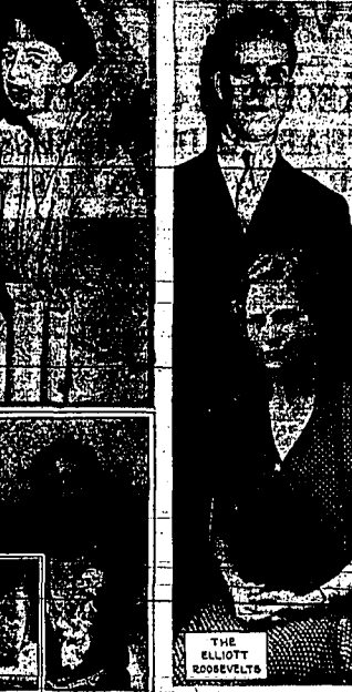
These are the famous Roosevelts who became the nation's first family today. They are four generations of the Roosevelt name. From left to right: Franklin D. Roosevelt, president-elect and Mrs. Roosevelt, shown at top, comprise the second generation. The first generation, Mrs. Roosevelt, shown at top, comprise the second generation.