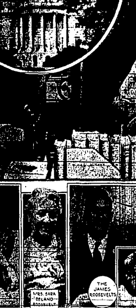
These are the famous Roosevelts who became the nation's first family today. They are four generations of the Roosevelt name. From left to right: Franklin D. Roosevelt, president-elect and Mrs. Roosevelt, shown at top, comprise the second generation. The first generation, Mrs. Roosevelt, shown at top, comprise the second generation.