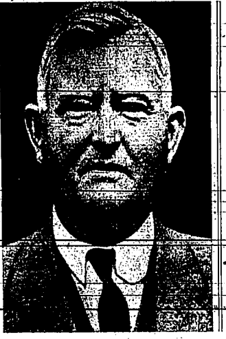
JOHN NANCE GARNER