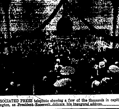
Telephoto showing a few of the thousands in capitol hall, Washington, as President-Roosevelt delivers his inaugural address.