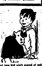
This new kid ain't scared of neither his shadow nor today but he's a little bit nervous if he ever bothered him.