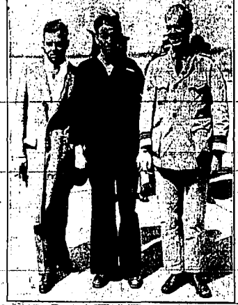
TRIO REPORTS ON AKRON DISASTER... THE THREE survivors of the Akron disaster reported at the navy department in Washington to give official version of the catastrophe...

EDOUARD HERRIOT PLANS TO ATTEND... REPRESENTATIVE OF ENGLAND COMES TO CONFERENCE... FREE TO DISCUSS EVERY INTERNATIONAL QUESTION... (By The Associated Press) PRESIDENT ROOSEVELT asks congress for authority for development of Tennessee river drainage basin and Muscle Shoals.