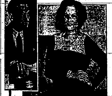
JAMES J. WALKER—former mayor of New York, and his friend, Betty Compton, the actress, called at the city hall in Cannes, France, and received full information about the marriage regulations there. Officials at the bureau said Walker notified them that he would be married soon.