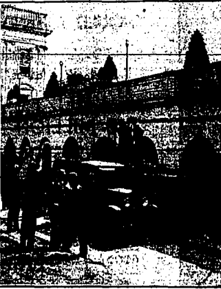
UNDER the cover of the long west wing extension of the White House which connects with the executive office, workmen have started digging for President Roosevelt swimming pool. Contributions sponsored by several news papers will pay for it's construction.