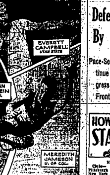
EVERETT CAMPBELL, UTAH STATE, is considered one of the best sprinters in the country.