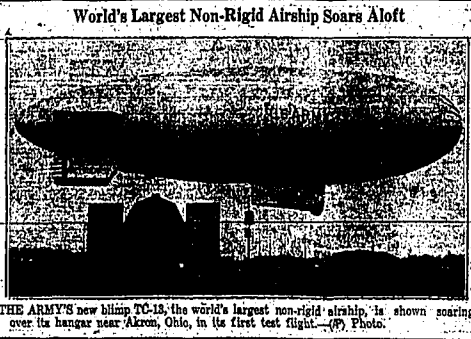
World's Largest Non-Rigid Airship Soars Aloft