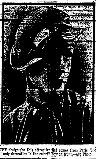
The design for this attractive hat comes from Paris. The only decoration is the colored bow in front.