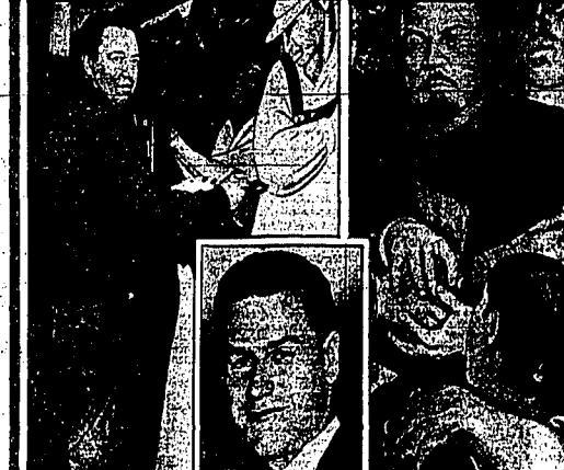
DERGO RIVERA (left), foremost Mexican artist, was dismissed as one of the painters whose huge murals were to decorate the great hall of the new 70-story building of Rockefeller center in New York...