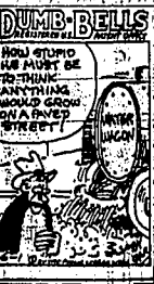
DUMB BELLS How often do you hear a dumb bell ring? ANYTHING WOULD GO ON WIGLEY FIELD