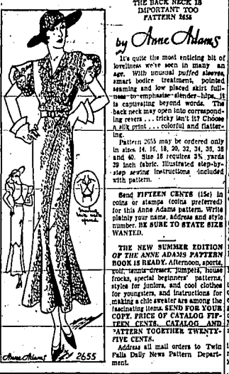
THE BACK NECK IS IMPROVED BY PATTERNS