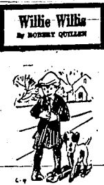
The barn got after, so I had to run back in an av'rage pug's little brother. He had my sack of merrill in his pocket.

UTAHN BUYS STOCK IN THEATRE CHAIN Twin Falls Houses Expect No Change Here as Result of New Ownership