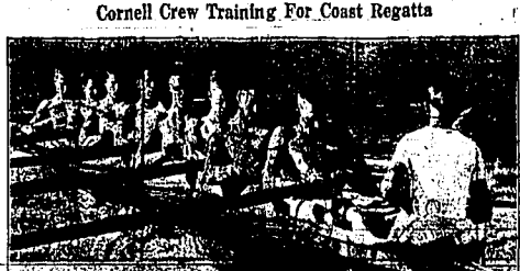
CORNELL'S varsity crew is shown during a workout on Lake Cayuga in preparation for the regatta at Long Beach, California, July 8. Among the crews entered are Washington, Yale, Harvard and California.

Teutonic Fighter Tells Reports Of Future Plans Loser in Latest Big Battle Hopes to Return With Bride in Fall for Another Bout with Californian NEW YORK, June 29.—Blushing bride Max Schmeling, former heavyweight champion who was knocked out by Max Baer last night, is expected to marry her American wife in the near future, according to reports from writers around him today to tell her he was sailing for Germany tonight to see his mother in Los Angeles, where she lives with her mother-in-law, the former champion's mother-in-law. Two years ago he had been defeated by Max Baer, who was his fiancée. And today, to the very man who had defeated him, Schmeling is expected to return with his bride in the fall. It is believed that Schmeling will return to California in the fall to fight another bout with Baer. He is expected to return with his bride in the fall.