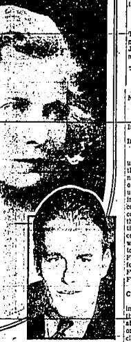
ELLIE ROOSEVELT, son of the president, and his wife, the former Elizabeth Taylor, would seek a Nevada divorce...