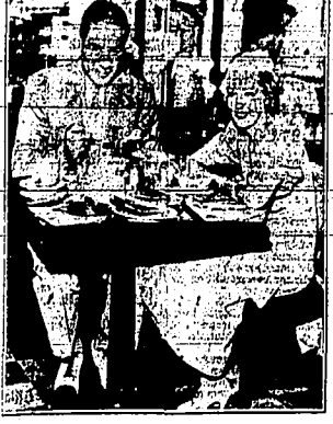
MAX BAER, newest heavyweight sensation after his smashing conquest of Max Schmeling, enjoys the fruits of victory at an afternoon "tea for two" in a New York restaurant with June Knight, Broadway musical comedy star, to whom the young coast giant is rumored engaged.

WASHINGTON, June 13.—The House today passed a bill to amend the law governing the purchase of state warrants at treasury notes.