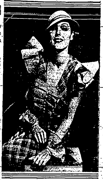
ADRIENNE AMES of the film introduces this new sports frock of tangerine brown and gray plaid, with jacket, belt and sleeves of gray linen. The hat and gloves also are of gray linen.—(7) Photo.

LOS ANGELES PRODUCE—Cattle: Receipts 17,400 pounds.