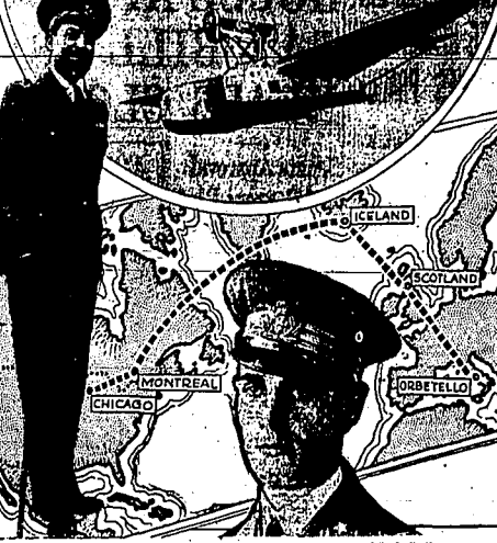
A SQUADRON of 24 Italian seaplanes under command of General Italo Balbo (left), aviation minister, availed favorable weather to take off from Orbetello, Italy, on a flight by easy stages over routes shown on map to the west fair at Chicago. There are 98 men in the expedition. Major Enea Silvio Roagna (below) is one of the leaders in the flight. Seaplanes of the type shown above are being used.