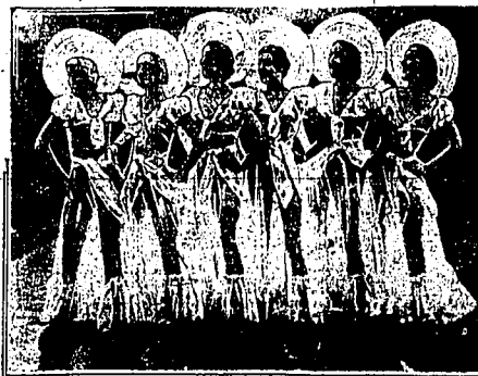
Girls from "Gold Diggers Of 1933" stage an eclipse of the sun in the new feature starting at the Orpheum this evening. The picture will show tonight.