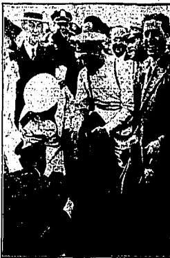
GENERAL ITALO BALBO, commander of Italy's fleet of 24 flying boats, was helped into a flying suit before he took off by plane from Ford Bennett field, New York, for Washington to call on President Roosevelt.

By the European delegates that Roosevelt was sure to accept his recommendation on currency stabilization, kept them waiting until 3 A. M. for reply. The reply, arriving much later, was a blunt refusal to the suggestion and to Moley's Copyright, 1933, by United Feature Syndicate, incorporated.