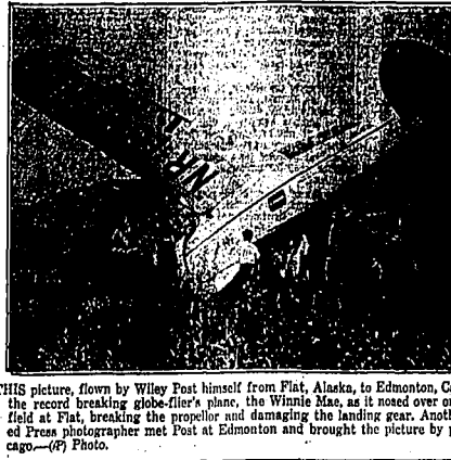
THIS picture, flown by Wiley Post himself from Flat, Alaska, to Edmonton, Canada, shows the wreck of the record-breaking globe-trotter's plane, the Winnie Mae, as it moved over the landing field at Flat, breaking the propeller and damaging the landing gear.