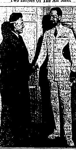
THE DAY after he had set a new speed record for circling the globe, Wiley Post met General Harold Gatty, chief of the Hain air armada, in New York. The famous pair had a chance to discuss some of their thrilling experiences in the air.