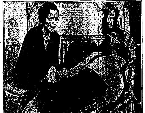
WILEY POST, on the point of exhaustion after his solo flight around the world in record time, is the epitome of all "tired out happy" figures as he reclines on a hotel couch in New York City with his wife holding his hand. Post bettered the 1931 world-circuit he made with Harold Gatty as navigator by more than 21 hours.

ably would contain they were not only of restraining trade was charged in the indictments because they dealt only in "service," such as laundry and dry cleaning, but in commodities. Baber said state attorneys through formation of associations by the cleaners themselves to eliminate vicious competition.