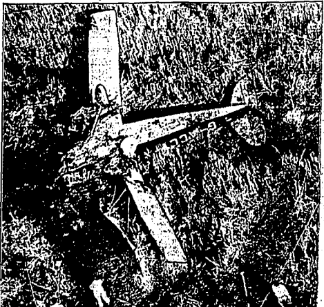
HERE is an excellent air view of the wreckage of the trans-Atlantic plane of Captain and Mrs. J. A. Mollison as it lay in the swamp at the edge of the Bridgport, Connecticut. The plane cracked up in making a forced landing after their ocean flight from England.