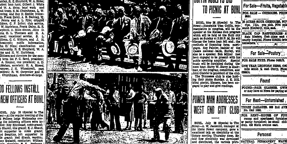
A RECEPTION committee, including Governor James Rolph, Jr., was at the California Nevada state line to welcome chief executive of other states...