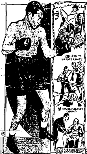
Barney Ross, Chicago's pugilistic idol, has trod a rocky road to the lightweight championship. His father has kicked him out of the house for being a Jew. He is a devout Jew and he won't fight on Jewish holidays.