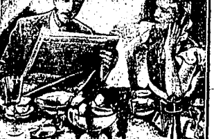
Ann Harding and William Powell in a honeymoon scene in "Double Happiness" which is playing at the Roxy Theatre.