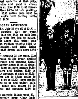
AS a part of the governors' conference in California, the thirtieth infantry was reviewed at San Francisco Presidio by the secretary of war.