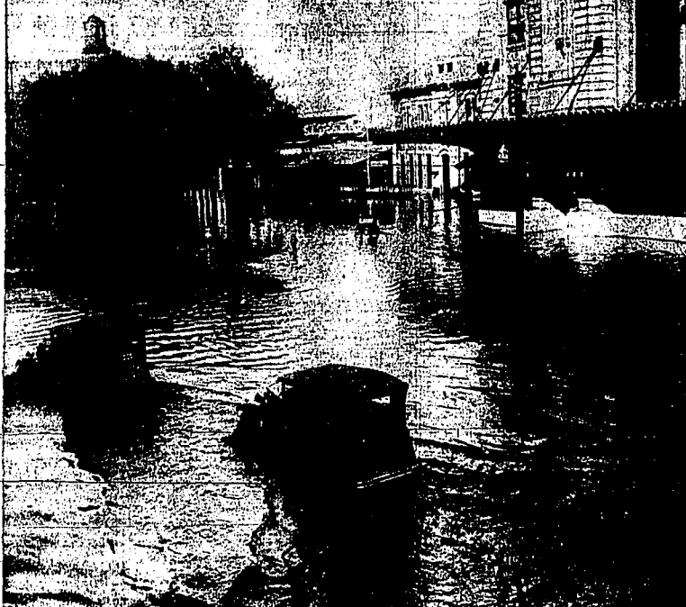
THE DENVER UNION STATION was flooded when floodwaters from broken Castleton dam swept down Cherry Creek, poured into the South Platte river and covered the lower part of the city. The subways leading to trains were completely filled, and eighteen inches of water stood in the station lobby.