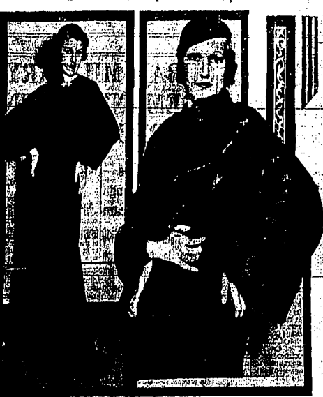
THE SLEEVES COME OFF of the gown shown at left to make it an evening dress. It is in the prevailing black and white with stylized say will be popular this fall. At the right is a swaggy model of natural mink, with a flaring tie and wide bell sleeves. These fashions were displayed at the western market week show in San Francisco.