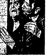
MARK DRESSLER and Wallace Spear, famous team of the film, appear together in the new feature, 'Tiptoe All Night' showing at midnight and Tuesday at the Orpheum theatre.