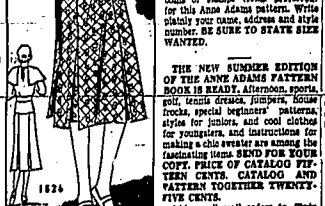
Send FIFTEEN CENTS (15c) in gold or stamps (please) for this dress pattern.

New in the real of Junior fashions is this adorable model created for young girls who want something different for school wear.