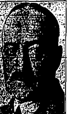
THIS IS a recent portrait of Carlos Manuel de Céspedes, who has succeeded Gerardo Machado as Cuba's chief executive.

Carlos Manuel de Céspedes, 57, was elected president of Cuba last night in a landslide victory over Gerardo Machado.