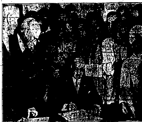
THIS picture shows Manuel de Cespedes (center), scholarly diplomat who was formerly Cuban minister to the United States...