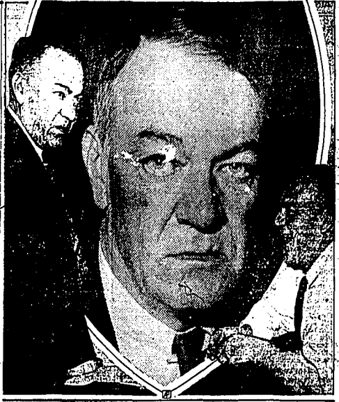
Hugh S. Johnson, NRA head, can blow like a top sergeant when he's fighting to get an industrial code adopted or laugh in hearty enjoyment over some humorous detail of his work.