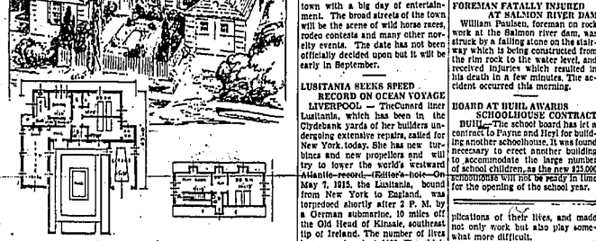
The small Colonial house illustrated embodies among other interesting features, an excellent use of the fore-court...