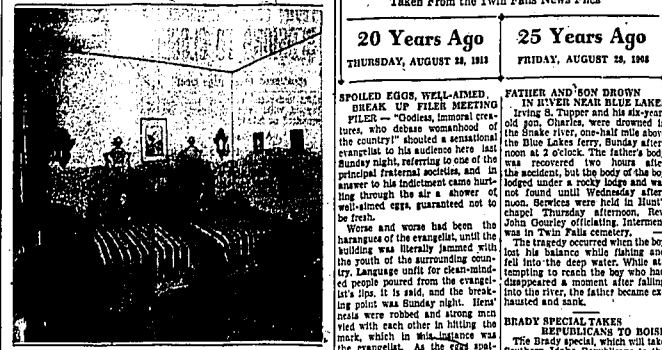
The striking bedrooms are from Spain. The bedroom designed for two girls of about 10 years, and about a year ago, was designed to conform to the Spanish architecture of the area.