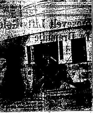
THIS picture shows how the forecastle of the steamship Madison was damaged by the fury of the Atlantic storm which held the ship at sea for hours before she reached port.