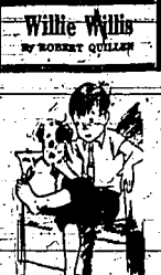
Willie Willis Mayor of Twin Falls

REGAL MOVEMENT SEEKS REMOVAL OF MAYOR AND COUNCIL Former City Office Figures In Officials' Information As Leader In Movement; Six Grounds For Complaint