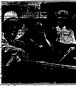
PRESIDENT ROOSEVELT returning to the White House after his vacation cruise aboard Vincent Astor's yacht Nurnahmal. The Cuban situation was the first consideration of the president when he returned to his desk...