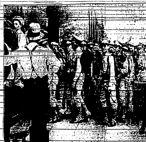
PRESIDENT ROOSEVELT has ordered a concentration of 1200 United States marines equipped as an expeditionary force at Quantico, Virginia...