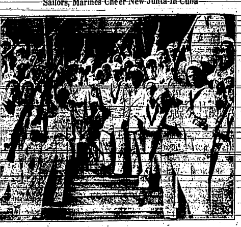
Sailors, Marines Cheer New Junta In Cuba

SCHOOLS DISAPPEAR Under Consolidation Plans And State Regulations Tiny Institutions Vanish