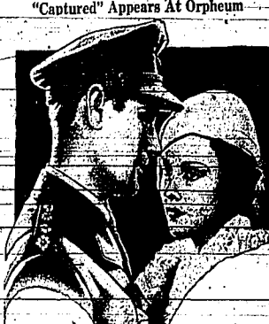
Leslie Howard and Margaret Lindsay are the striking new couple who have dazzled all other screen lovers. They are appearing together in "Captured," Warner Brothers' latest smash, coming to the Orpheum tomorrow.