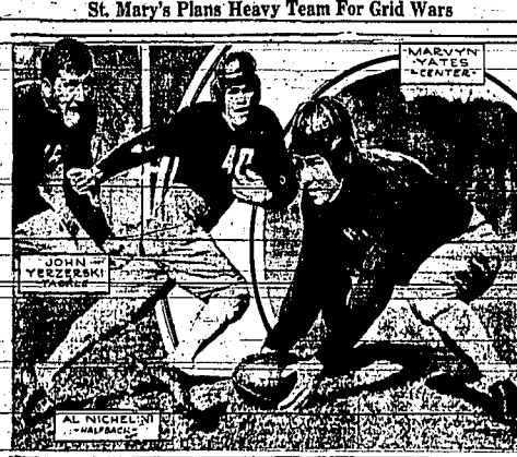
St. Mary's Plans Heavy Team For Grid Wars

Enthusiastic Crowd of Fight Fans Witnesses Thrilling Contests on Weekly Program of Service Club