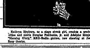
Katharine Hepburn At Joe-K's Roxy