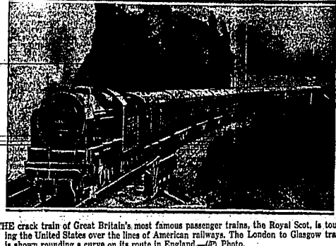
THE CRACK TRAIN of Great Britain's most famous passenger trains, the Royal Scot, is touring the United States over the lines of American railways. The London to Glasgow train is shown rounding a curve on its route in England.