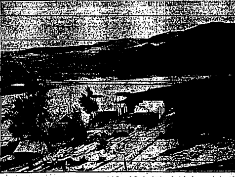
THE FIRST WORKMEN on the site of the Grand Coulee hydroelectric dam project on the Columbia river in Washington are making last pits to determine how deep the foundations for the dam will have to be sunk. Photo shows the first construction camp at the site.