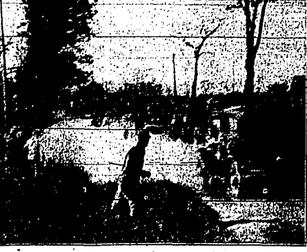
THIS picture shows picketing farmers retreating to their automobiles near Waterford, Wisconsin, as tear gas was scattered by officers to disperse them. The pickets had attempted to dump milk from two trucks which were attempting to reach market.