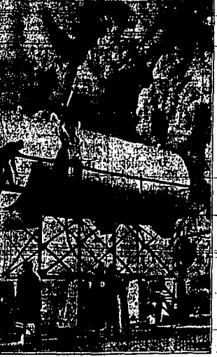
WORKMEN are shown fighting the oil fire at Tiverton, Rhode Island, where three men were known to have died and many were injured as tanks exploded and fire followed.