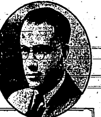
Portrait of a man, likely related to the Dyerby article.