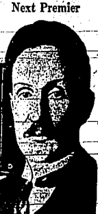
CAMILLE CHAUTEMPS, radical Socialist leader, who according to indications now will be summoned to form a new French cabinet.

WALLACE ASKS FOR TRADE AGREEMENTS Secretary of Agriculture Outlines Plans to Restore Foreign Buying Power