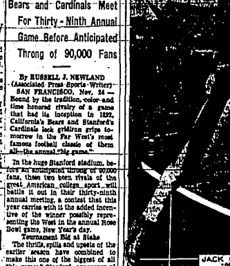
JACK DUCKLER FRSD BORRIES