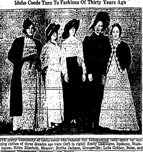
Idaho Coeds Turn To Fashions Of Thirty Years Ago

Funeral services were held at the Kimberly Methodist church.