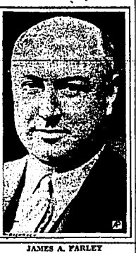
JAMES A. FARLEY

Federal Building Annex at Pocatello Dedicated by Postmaster General