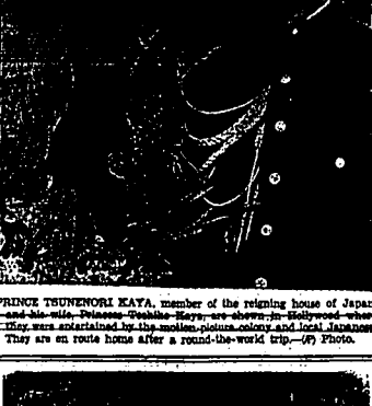
Princess Tsunehiko Kaya, member of the reigning house of Japan, and his wife, Princess Katsuko, have returned to their home in Tokyo...