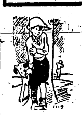
That new kid don't fight fair. Had him down, rabbit-die-for-his-ears an' he tried to bite me."