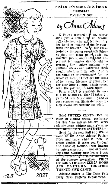
Send FIFTY CENTS (10¢ in coin or stamps) to: Anne Adams Pattern Co., 2027