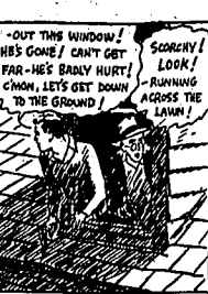
Out the window! He's gone! Can't get fear—he's badly hurt! Chom, let's get down to the ground! Scorchy! Look! Running across the lawn!