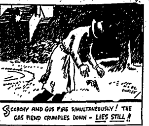
Scorchy and Gus fire simultaneously! The gas fiend crumples down—lies still!