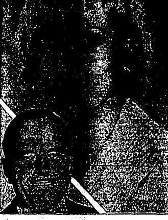
DOUGLAS FAIRBANKS, and Mary Pickford will be separated by an interlocutory decree of divorce within the month...