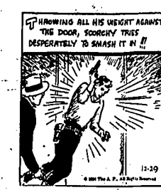
Showing all his might against the door, Scorchy tries desperately to smash it in!