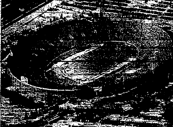
EIGHTY FIVE thousand persons crowded into the stadium at Pasadena, California, to witness the annual East-West football game featuring the Tournament of Roses football team from Alabama and Stanford universities.