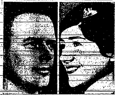
CHARLES AUGUSTUS LINDBERGH, Jr. (lower left) and Bruno Richard Hauptmann, German captives, face the death penalty in a trial today.