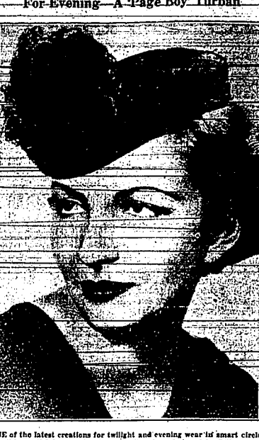
ONE of the latest creations for twilight and evening wear is smart circles in this youthful appearing "page boy" turban, designed by Lilly Dache. It is featured in glass taffeta.—P. Photo.

The Tallman was observed a mile or two distant on the Tallman's starboard. She was steering the Tallman's starboard.