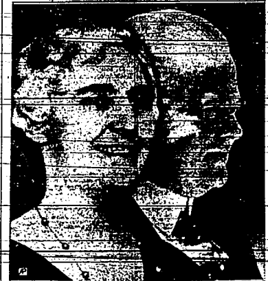
Former President and Mrs. Herbert Hoover expect to observe their thirty-fifth wedding anniversary in New York City on February 10. Mrs. Hoover has carried over her tentative plans for a family reunion at Palo Alto, Cal., had to be discarded because Mr. Hoover is to be inducted as a director of a life insurance company in New York.

PALO ALTO, Cal. (AP) — Instead of holding a family reunion here as they had tentatively planned, former President and Mrs. Herbert Hoover will celebrate the thirty-fifth anniversary of their wedding February 10, in a quiet way in New York City.