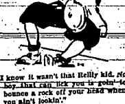
I know it wasn't that Billy kid, no boy that can kick your head when you ain't lookin'.