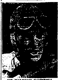
SIR MALCOLM CAMPBELL