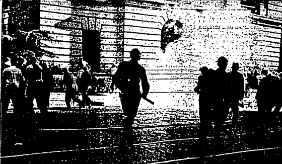
EXCITEMENT reigned high in Tacoma, Wash., when more than 1,000 lumber strike pickets and sympathizers gathered in front of the federal building for a proposed march on the industrial center, and three companies of national guardsmen and a navy shore patrol had to battle for several hours to disperse the mob.