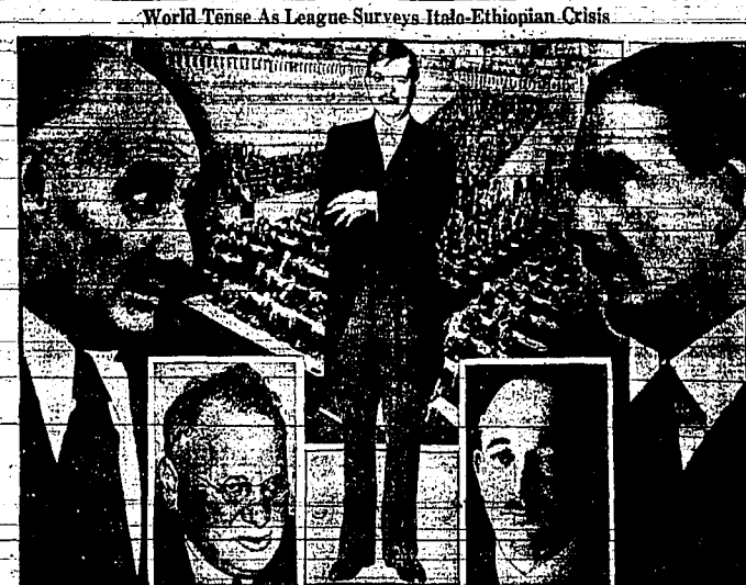
World Tense As League Surveys Italo-Ethiopian Crisis