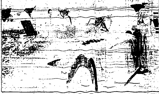
BLUEBIRD AND SKIPPER 'GO TO TOWN'

SAN FRANCISCO, Sept. 4.—Charles "Gabby" Street, 33, was reinstated in the Pacific Coast League today.