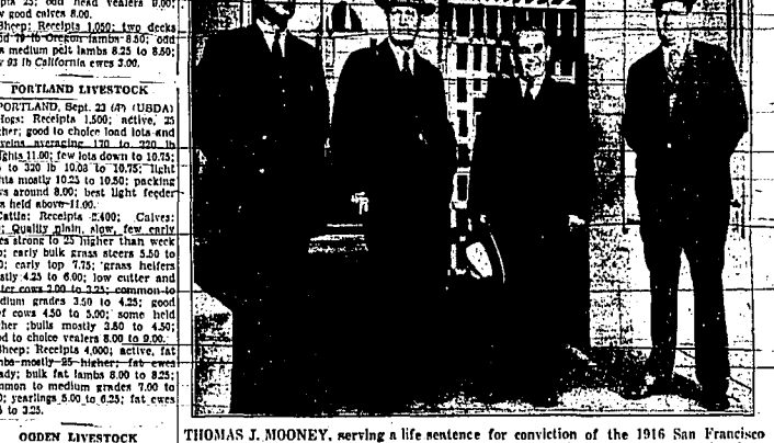
THOMAS J. MOONEY, serving a life sentence for conviction of the 1916 San Francisco Preparedness Day bombing, left San Quentin prison temporarily for the third time to attend a hearing ordered by the California Supreme Court...