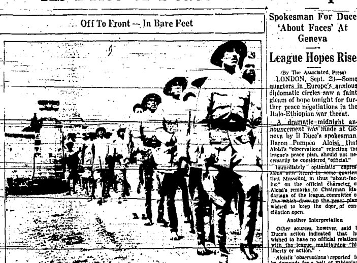
AN ETHIOPIAN regiment, unshod almost to a man, is shown marching out of the Imperial Palace at Addis Ababa on its way to the front after receiving the blessings of Emperor Haile Selassie—(AP) Photo.