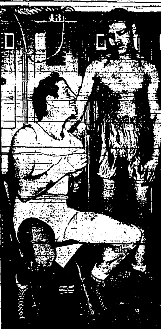
"THE HEAD that wears the crown must stop one of these fists." That's what Max Baer, the heavyweight champion, said Joe Louis in Detroit less than a year ago during a friendly dressing room meeting, pictured above. Training for his "comeback" bout with Louis at the Yankee Stadium tonight, Baer frequently referred to the impression he says he made on the young Negro boxer at that time.

to beat Joe Louis tomorrow night. Every dollar here clinics "Baer to win." Fans of the little community have bet a total of something like $12,000 on their favorite who started his ring career here as years ago (including a swinging bet of what is a "grammatum" which was a remedied chicken-coop. The total bet by Livermoreans represents $850 for every man, woman and child.) Baer has telegraphed assurance to his friends here as follows: "I won't last long. I'm out to win as quickly as possible." As for Livermore is concerned the "car" has spoken.