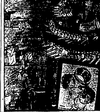
An Ethiopian art exhibit in Paris, contained besides hunting scenes, swords, shields, and stanzas, these two canvases. The large one depicts England's defeat of Emperor Theodore in 1638 with the monarch consulting his suite. The first, because of its resemblance to the work of some "moderns," aroused considerable interest.