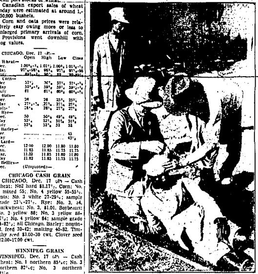
MEMBERS of the Red Cross in Fibolia render aid to a native wounded when the Italian air squadron bombed the city. Red Cross units were dispatched from Addis Ababa to the northern front as the fighting became active and airplanes shelled native towns.