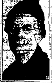
LIZETTE WOODWORTH REESE