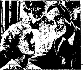
Anita Louise and Nino Martini are the romantic stars of "Here's To Romance" which introduces Martini's golden voice to screen fans at the Orpheum theater today. Miss Schumann-Heink also makes her film debut in the attraction.

DICK POWELL IN IDAHO THEATER'S RETURN HIT