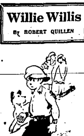
It ain't fair. Girls whisper and stare about the patch on your pants because they know you can't rock 'em.