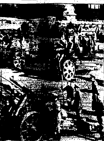
SHOWN in this radiophone is heavy mobile artillery of the German army drawn up in a square in Cologne masked by a large slaughter house visible in the background. In the foreground is a 144-millimeter gun. The artillery, moved up when Nazi troops suddenly recaptured the Rhineland area, is camouflaged.