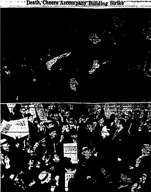
Death Cheers Accompany Building Strike The first fatality in the building service employes' strike which has tied Manhattan into knots was counted on the walkout's fifth day.

NOTICE: August 1936 for the army to increase its airplane supply—loses by obsolescence and washouts more than balance new supply.