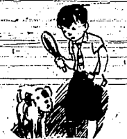
"That hair grows of Papa's salt and good. I've been cutting for two weeks and ain't got no sign of a mistake yet."