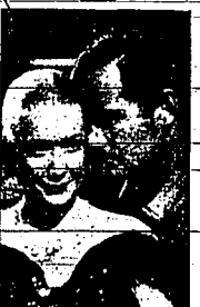
Beginning tomorrow at the Idaho theater is "Barbary Coast" with Miriam Hopkins, Edward G. Robinson and Joel McCrea. — It is the story of old San Francisco which was the notorious mecca of adventurers from every corner of the globe. In this picture a first named Swan is stranded in the city of gold-mad, love hungry men and