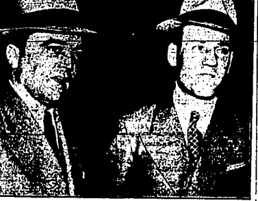
J. EDGAR HOOVER (left), director of the department of justice, bureau of investigation, and his chief assistant, Clyde A. Tolson, are shown as they left a presslight at Washington, D. C., which he was attending...