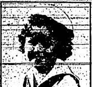
Dainty Miss Shirley Temple will be seen at the Orpheum for four days starting tomorrow in "Captain January." — Story all the world loves. Guy Kibbee, Slim Summerville and a big cast lend able support to the charming little star. Eddie Cantor in "Strike Me Pink" will be at the Orpheum.