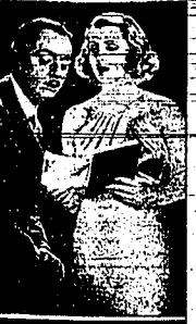
William Powell introduces a party to murder that they comedically starred with Jean Arthur in "The Excelsior, Bradford" Boasting the tradition that screen acting must flow their work — which he amusingly upheld in "The Thin Man," he portrays an amateur detective who hates detecting.