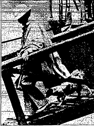
HERE is Emperor Haile Selassie of Ethiopia, accompanied by his dog, his constant companion, as he descended the plank of the British cruiser Enterprise at Haifa, Palestine, in his flight from his country conquered by the Fascists.