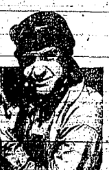
BARNEY OLDFIELD AT THE WHEEL

Barney has credited all his wins to his tires, and he has decided to build a tire that is better than any the world has ever seen.